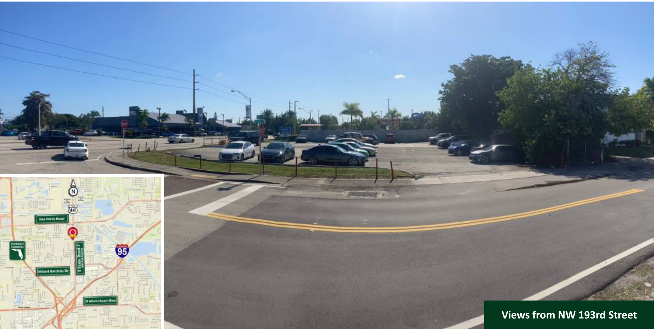
Views from NW 193rd Street

Tremendous opportunity for development, with incredible visibility - high traffic counts of 53,500 vehicles per day (on US-441)